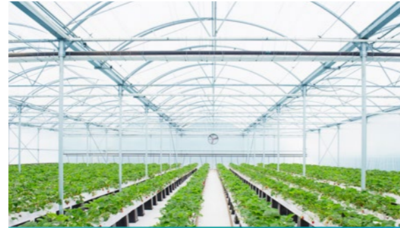
Simple controlling ↗