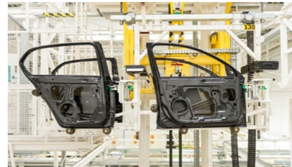
Higher-level controlling ↗