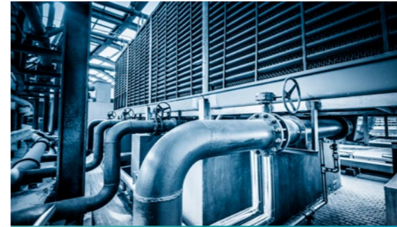
Simple closed-loop controlling ↗