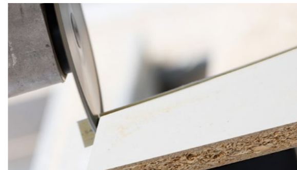
Cutting and sawing ↗