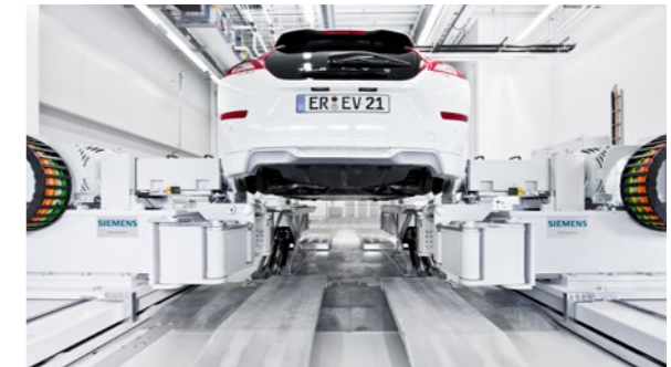
Testing and measuring ↗