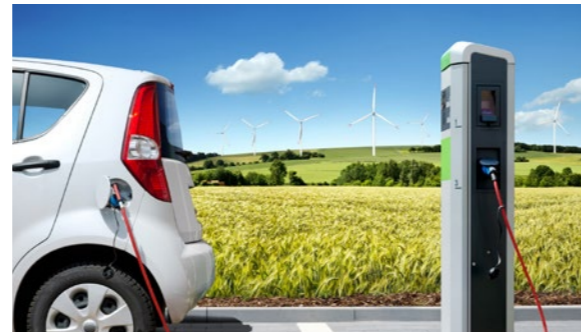
Electrical charging ↗