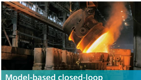
Model-based closed-loop controlling ↗