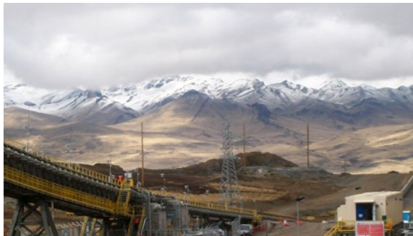
Conveying and transporting ↗