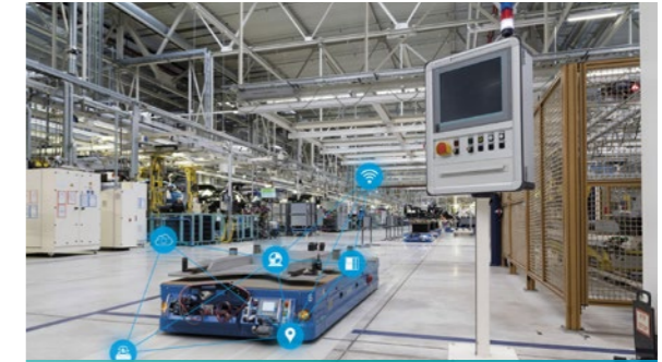
Autonomously conveying ↗