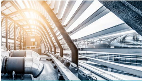
Pumping and ventilating ↗